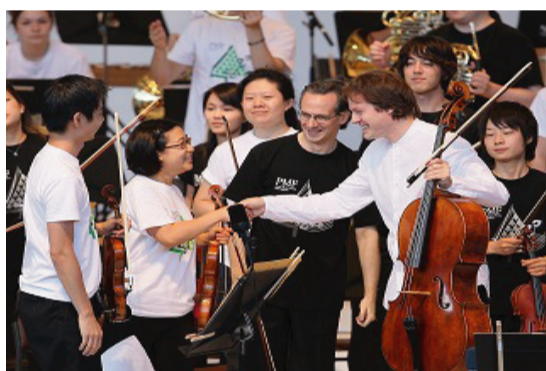
After the Concert

PMF Organizing Committee: http://www.pmf.or.jp