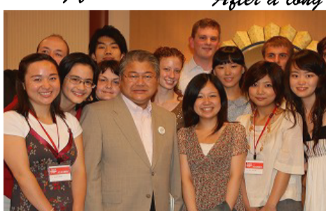
Academy with Mayor of Sapporo